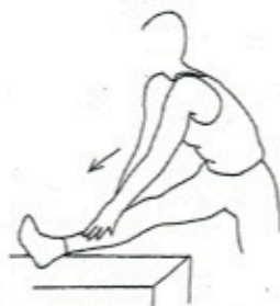
Standing hamstring stretch