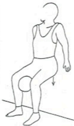
Wall squat with a ball