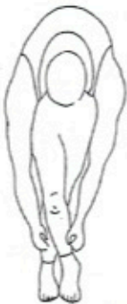
Iliotibial band stretch